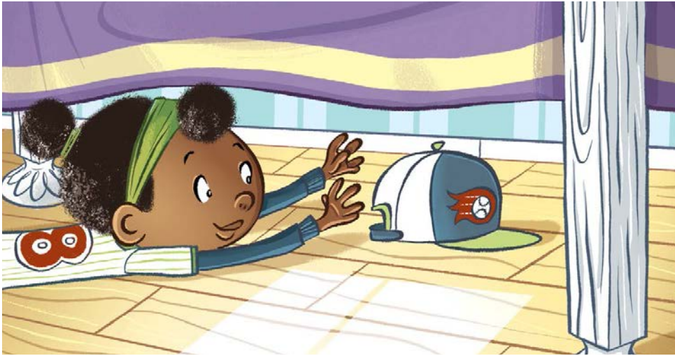
A hat is under my bed.