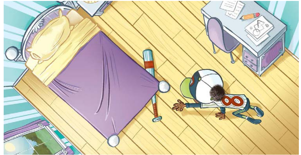
A bat is under my bed.