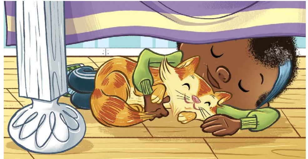
I am under my bed!