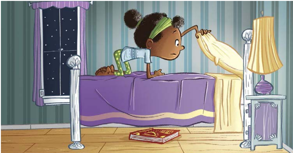
A book is under my bed.