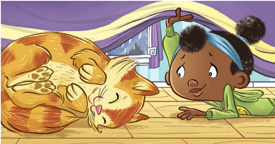
A cat is under my bed.