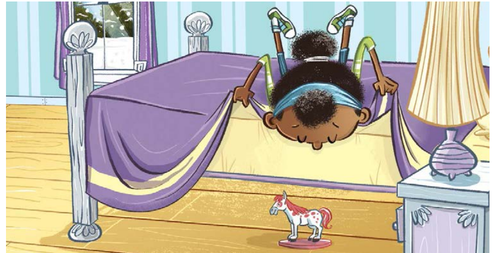
A toy is under my bed.