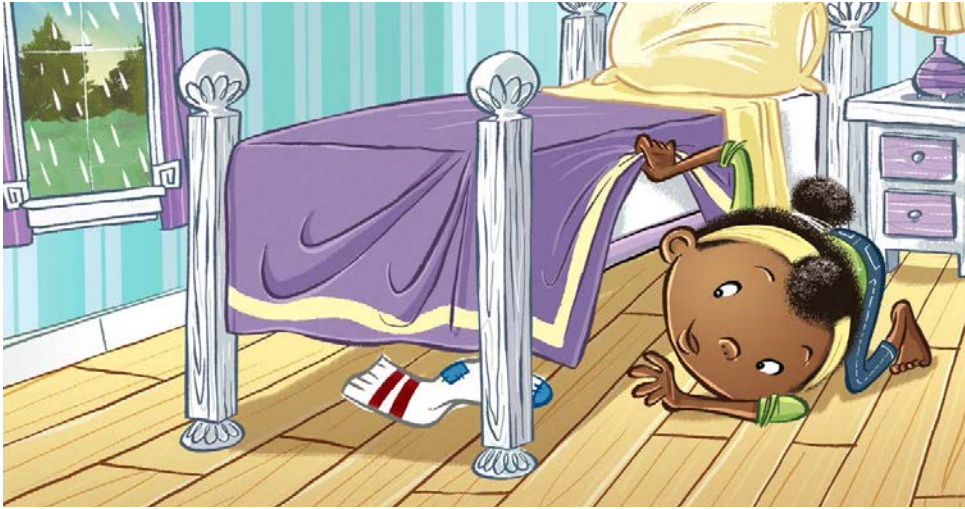
A sock is under my bed.