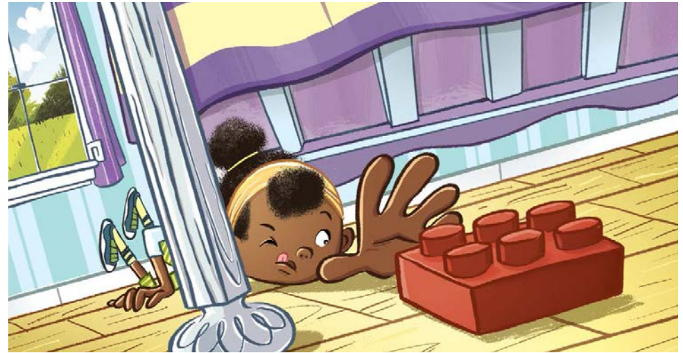
A block is under my bed.