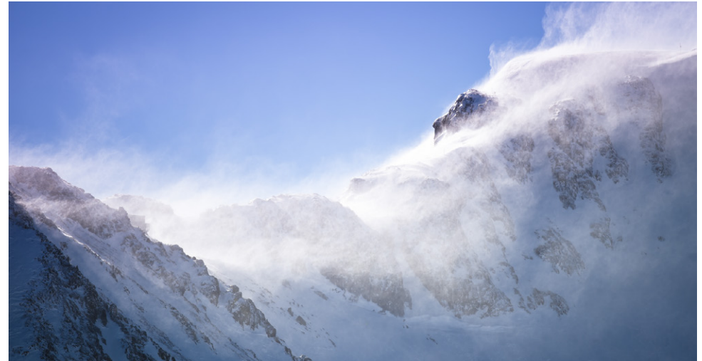
Wind blows across the snow.