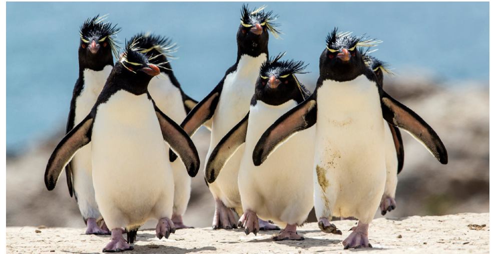
Wind blows against the birds.