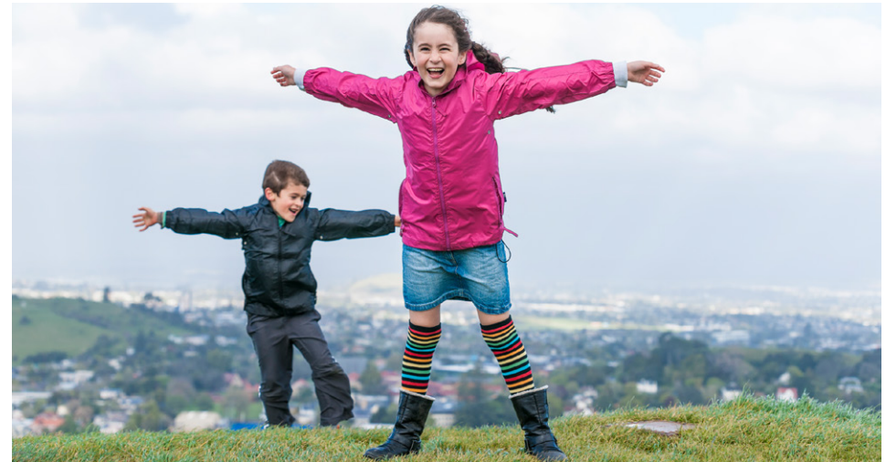
Wind blows into me!