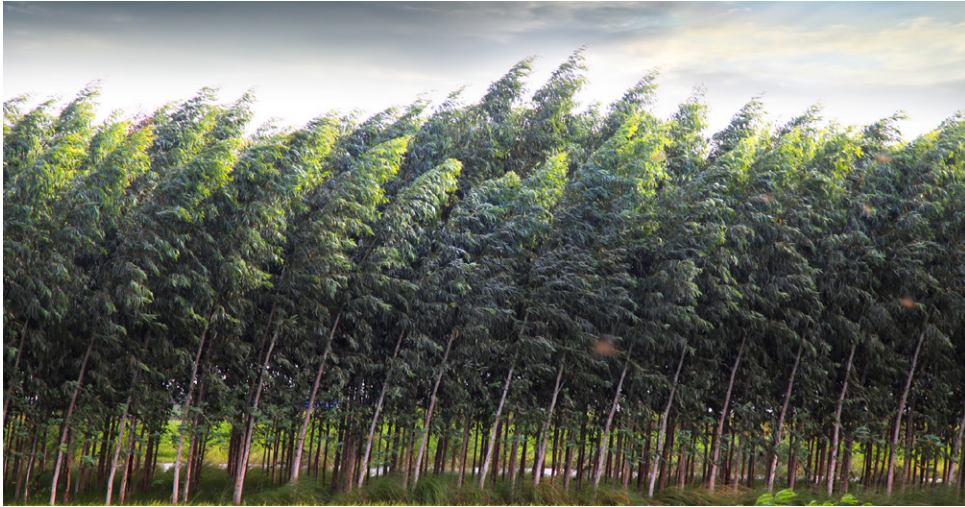
Wind blows on the trees.