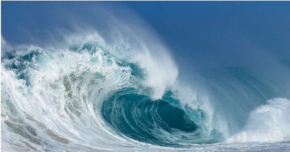
Wind blows over the water.