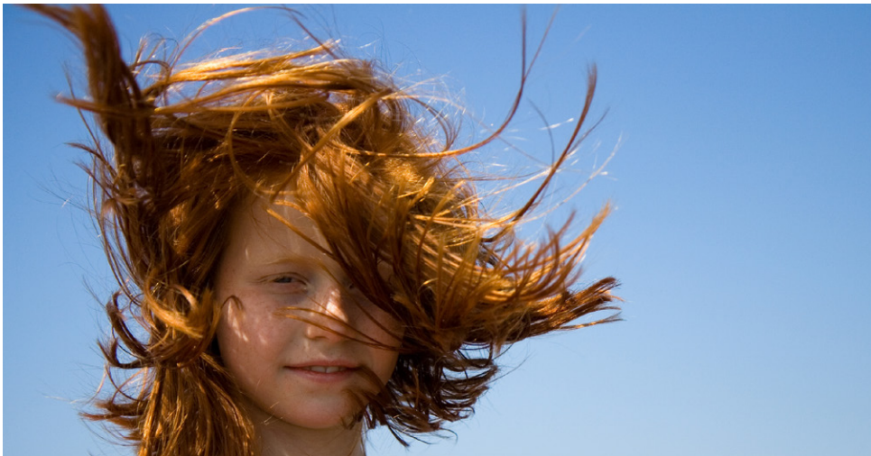
Wind blows through the hair.