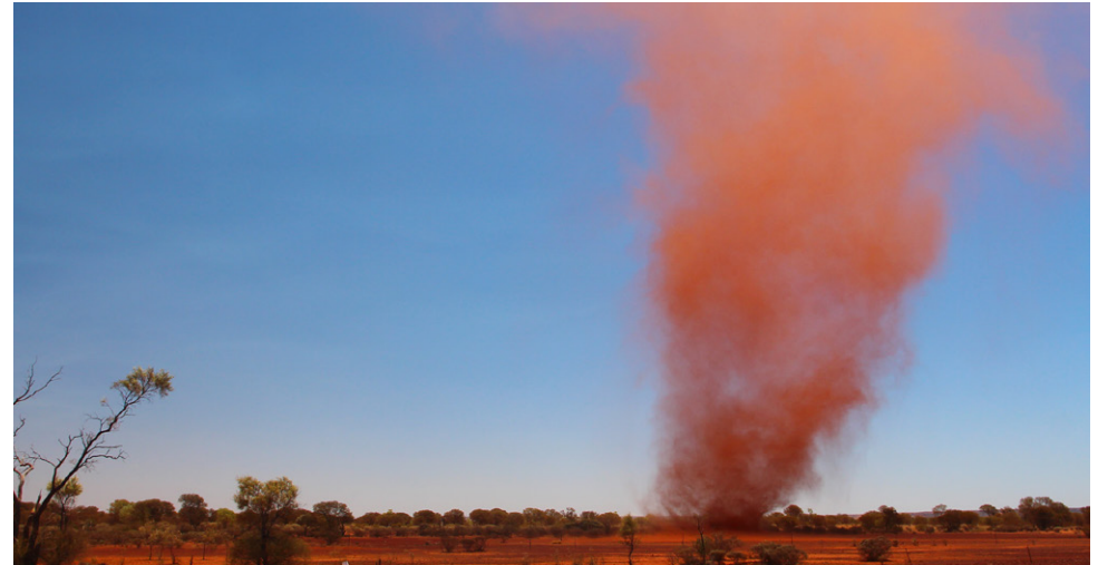
Wind blows up the sand.