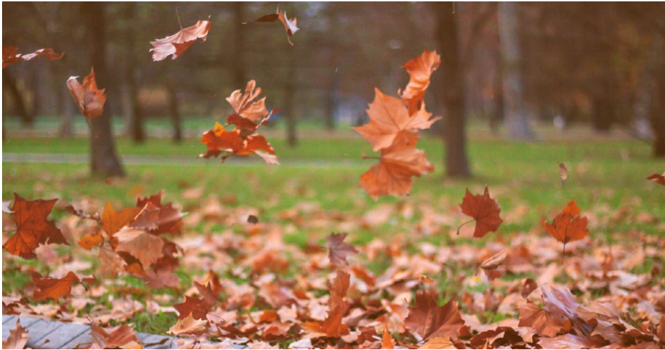
Wind blows away the leaves.